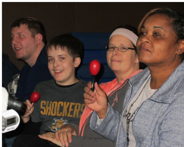
Everyone getting into the holiday spirit!