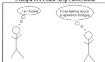
Example of a Comic Strip Conversation