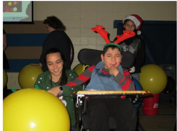
Upper and Lower Right: Students and staff performing "Drum Fit" during the program.